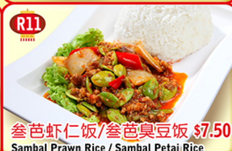
R11 叁芭虾仁饭/叁芭臭豆饭 $7.50 Sambal Prawn Rice / Sambal Petai Rice