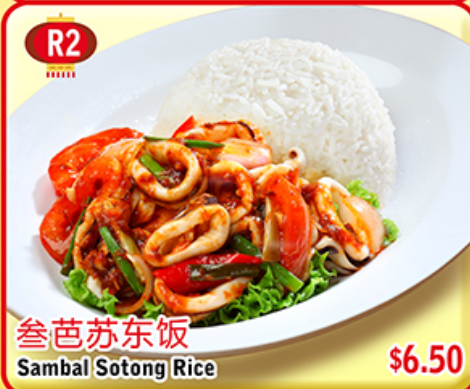
R2 叁芭苏东饭 $6.50 Sambal Sotong Rice