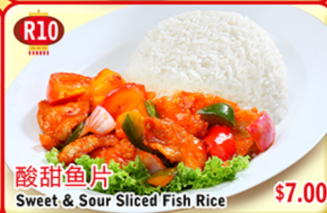
R10 酸甜鱼片 $7.00 Sweet & Sour Sliced Fish Rice