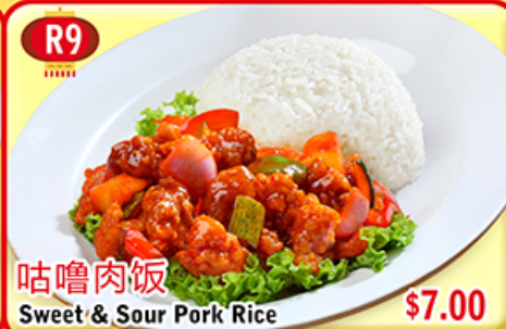
R9 咕嚕肉饭 $7.00 Sweet & Sour Pork Rice