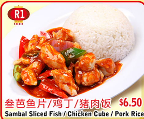
R1 叁芭鱼片/鸡丁/猪肉饭 $6.50 Sambal Sliced Fish / Chicken Cube / Pork Rice