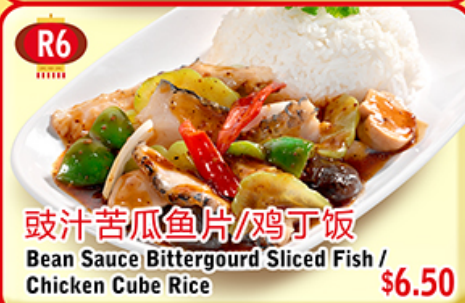
R6 豉汁苦瓜鱼片/鸡丁饭 $6.50 Bean Sauce Bittergourd Sliced Fish / Chicken Cube Rice