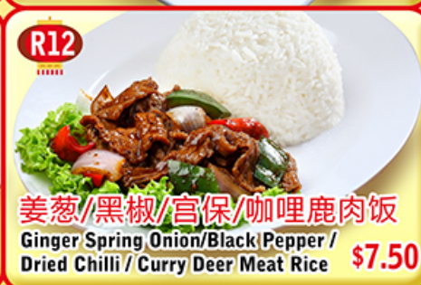
R12 姜葱/黑椒/宫保/咖喱鹿肉饭 $7.50 Ginger Spring Onion/Black Pepper / Dried Chilli / Curry Deer Meat Rice