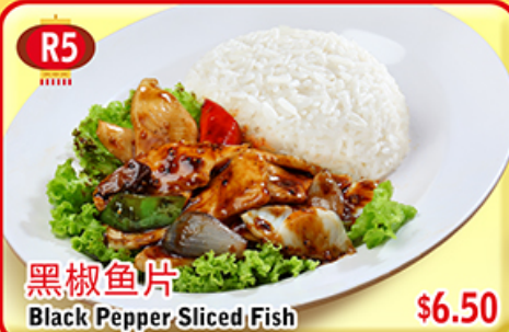
R5 黑椒鱼片 $6.50 Black Pepper Sliced Fish