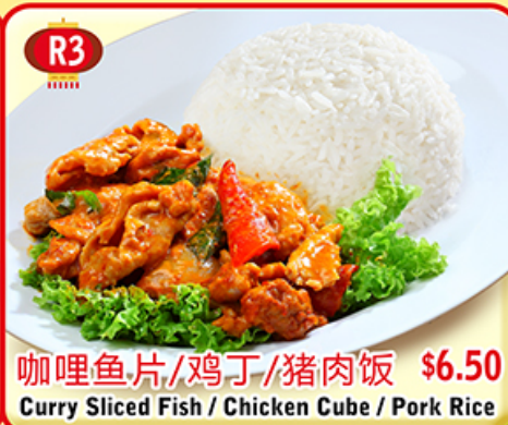
R3 咖喱鱼片/鸡丁/猪肉饭 $6.50 Curry Sliced Fish / Chicken Cube / Pork Rice