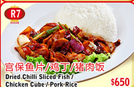
R7 宫保鱼片/鸡丁/猪肉饭 $6.50 Dried Chilli Sliced Fish / Chicken Cube / Pork Rice