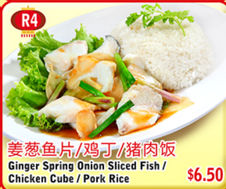
R4 姜葱鱼片/鸡丁/猪肉饭 $6.50 Ginger Spring Onion Sliced Fish / Chicken Cube / Pork Rice