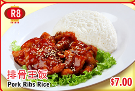
R8 排骨豉饭 $7.00 Pork Ribs Rice