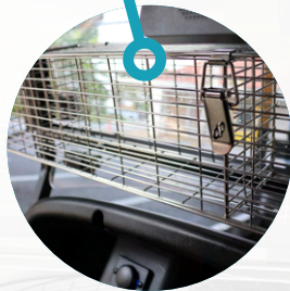
Steel Cage with Clip-on Lock