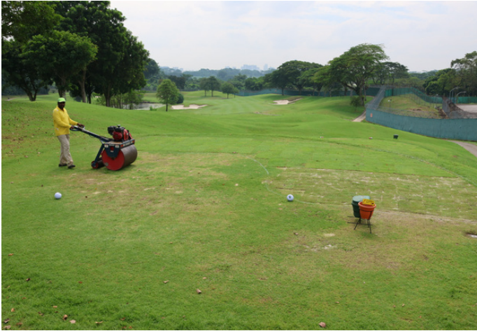
Black Tee Box 11 - 1 Week Apart After Treatment