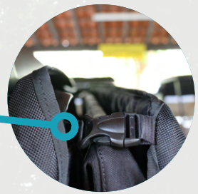
Quick-Release Buckles for Ease of Use