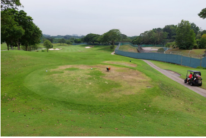
White Tee Box 11 - 1 Week Apart After Treatment