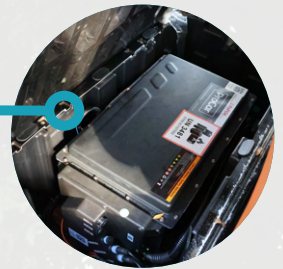
Improved Batteries to Ensure Undisrupted Play