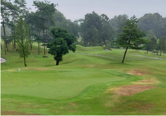
Green 15 - 4 Weeks Apart After Treatment