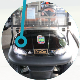
Headlights for Enhanced Safety