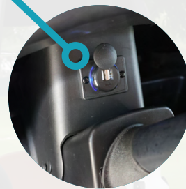
Repositioning of Charging Ports