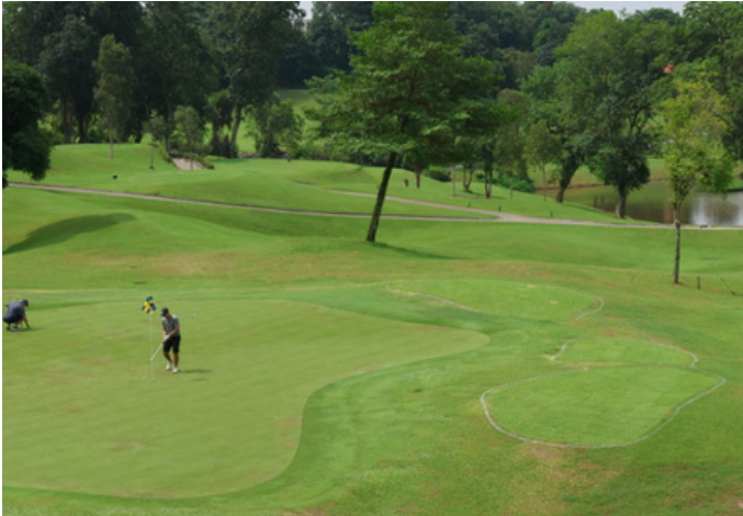
Fairway 13 - 3 Weeks Apart After Treatment