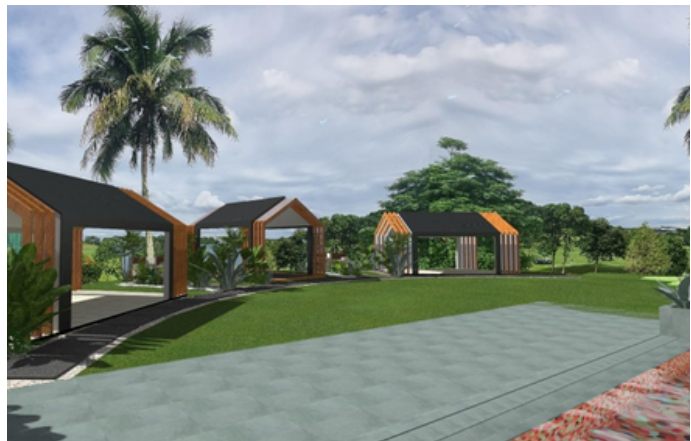
Cabanas at the far end of the pool overlooking the golf course