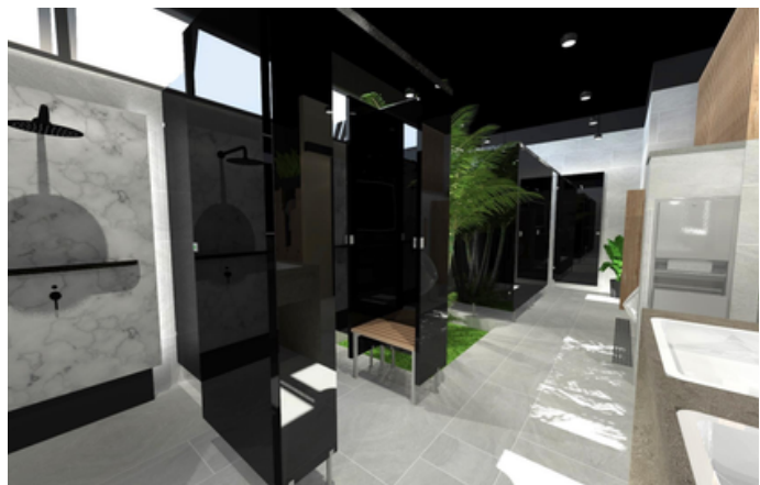
Note: Visuals depicted are based on 3D artist impressions