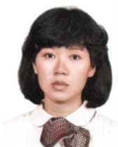
CHIA SOCK KAM

21 October 2023 Palm Resort Golf and Country Club, Malaysia Hole 12