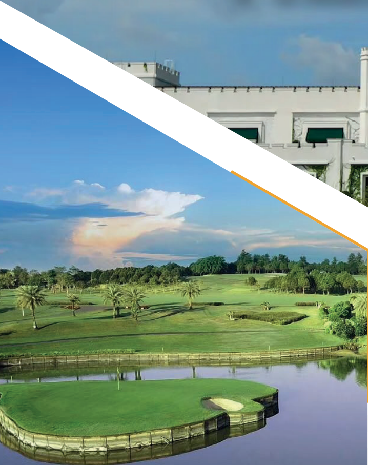
THE RG CITY GOLF CLUB