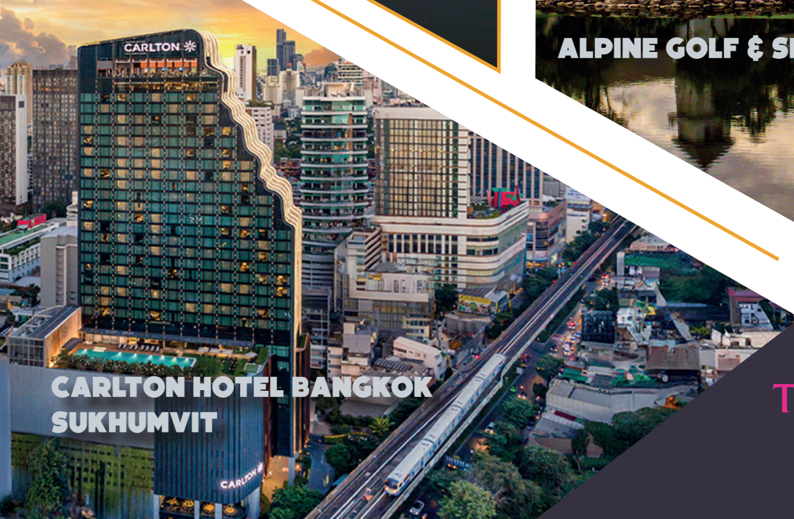
CARLTON HOTEL BANGKOK SUKHUMVIT